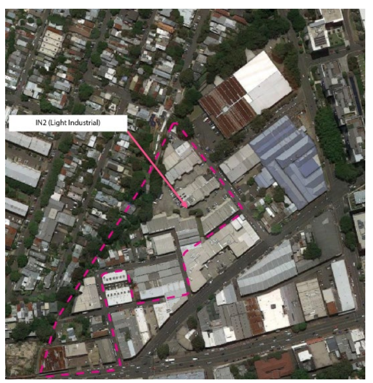
Figure 2 - Extract from Leichhardt's Industrial Precinct Planning Report 2016 which made recommendations for the redevelopment of Camperdown precinct including an option to reconfigure the rezoning of the Camperdown precinct to B5 Business Development with Light Industrial IN2 uses on the periphery.